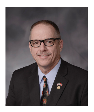
State Representative Chuck Basye, District 47 201 W Capitol Ave, Room 401-A Jefferson City, MO 65109

Phone: (573) 751-1501 Chuck.Basye@house.mo.gov